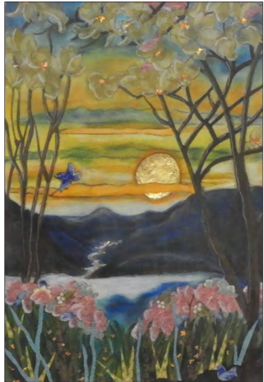
Jean Sturrock, "Yellow Moon", Pastel/Collage